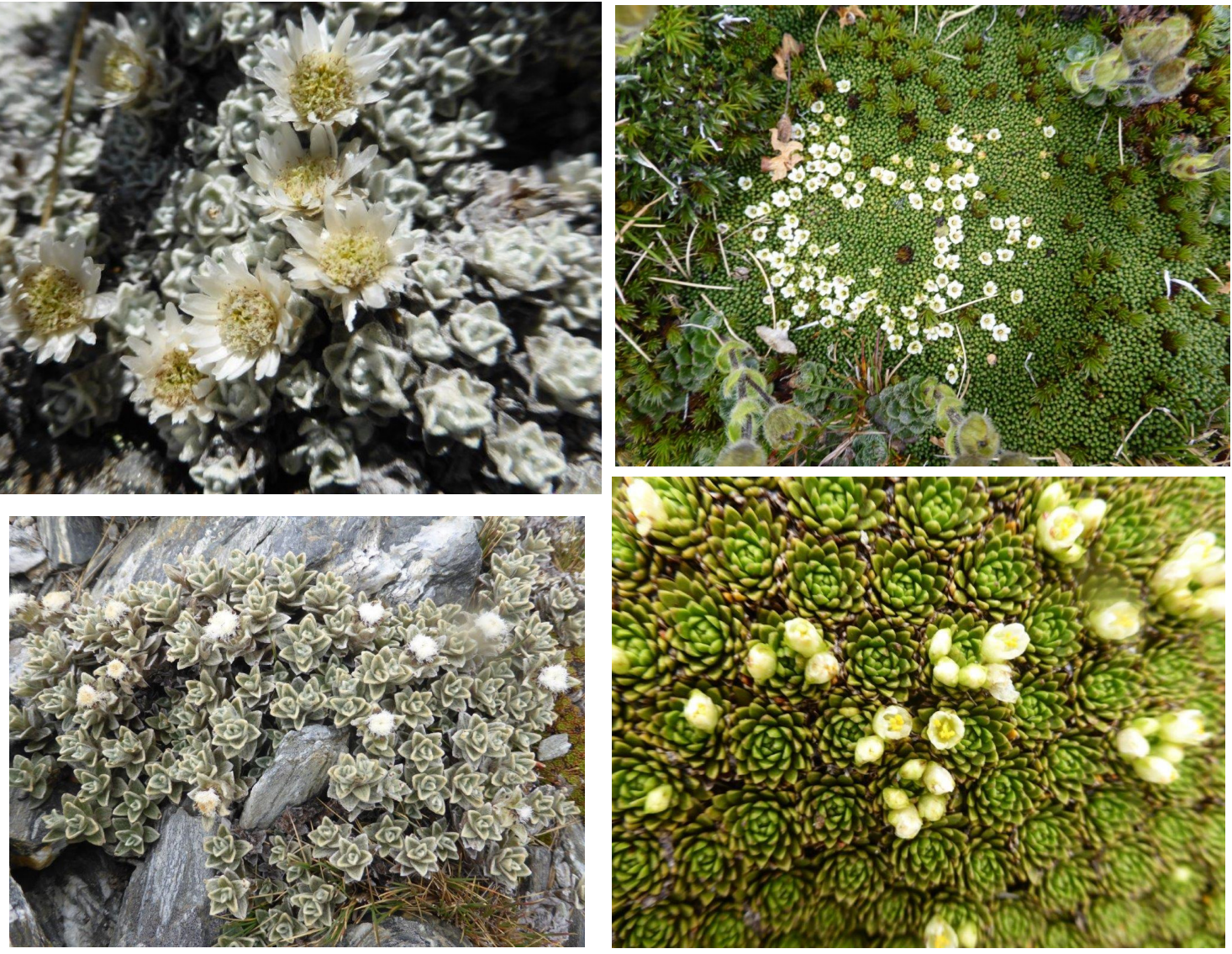
Top right: Raoulia subsericea, Centre right: Phyllachne colensoi, Botton right:: Hectorella caespitosa,