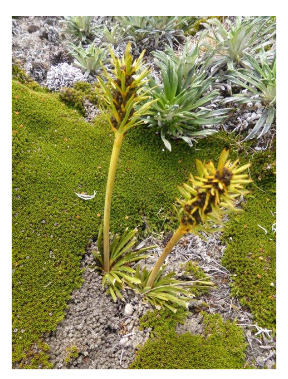
Bottom left: Aciphylla hectori ,