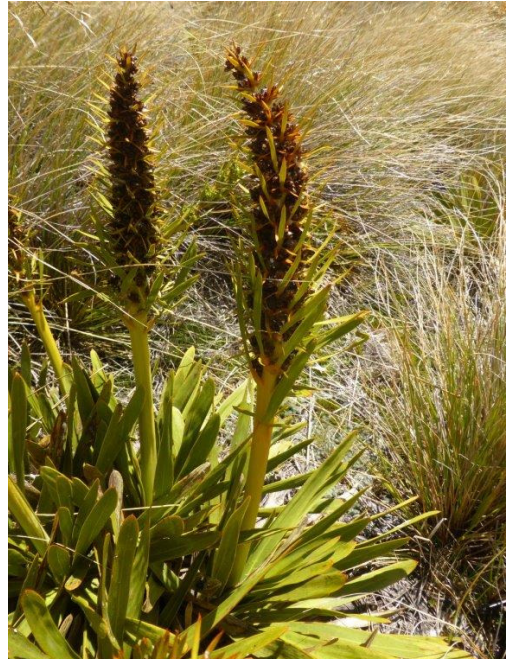
Top left: Gentianella divisa ,