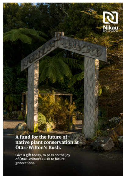
Ōtari-Wilton's Bush Fund brochure