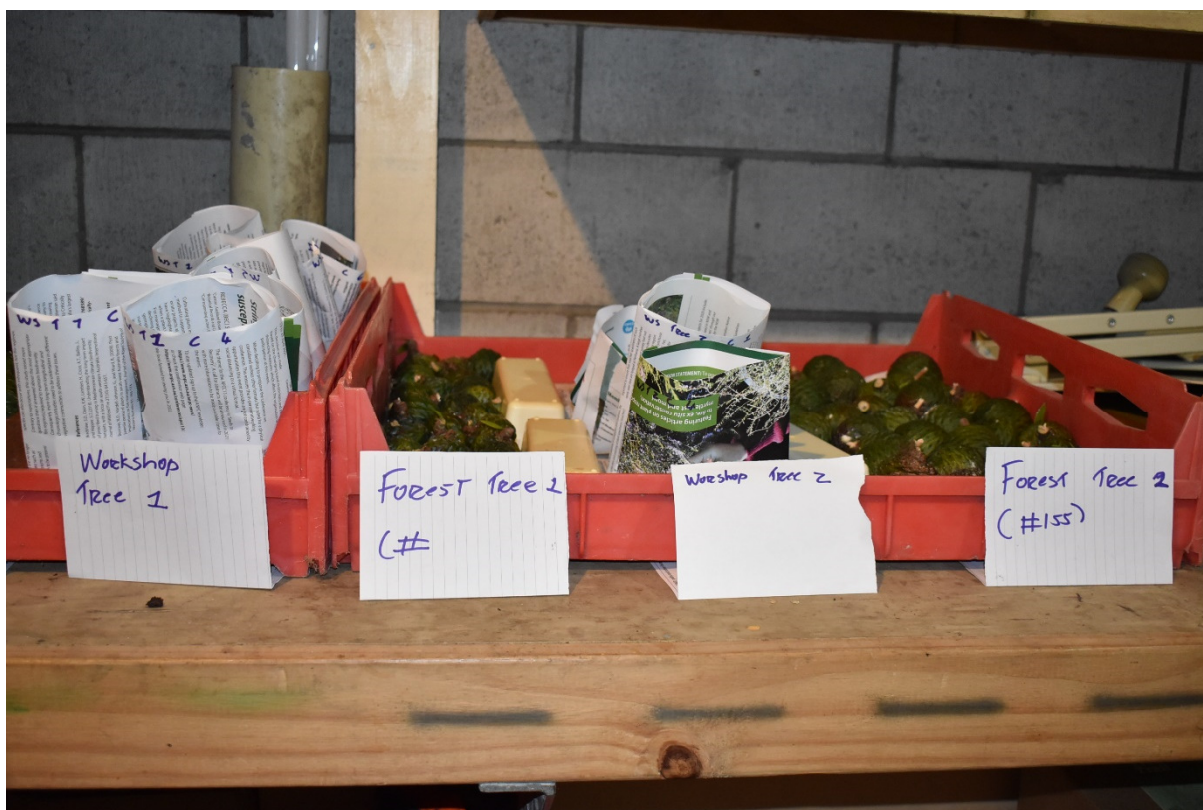
Figure 2: Agathis australis (kauri) collected in March 2021 ready for measuring and processing.

In June last year we secured a grant from the Royal Society for the conservation and restoration of Araucariaceae in the Pacific Region. The project concept was seeded by the results from all those kauri cones and seed processed with the help of so many Trust members since the first lockdown in 2020 (Fig. 2). This project will bring together an international research team from New Zealand (Ōtari lab, Plant and Food Research and Victoria University of Wellington), Australia (PlantBank), Fiji (Pacific Community's Centre for Pacific Crops and Trees), UK (Kew Millennium Seed Bank) and Spain (University of Valencia). The research team will investigate the best ways to collect, grow and store seed from various Agathis species and Wollemia nobilis (Wollemi pine). The first kauri cones have started to fall during the last week of February and arborists are on their way to help us collect from various trees at Ōtari. As soon as we have sufficient seed, I will be visiting the tissue culture lab at Plant and Food Research in Palmerston North where we will be looking at the lipid behaviour in the kauri embryos using differential scanning calorimetry. In June all the researchers will spend a week at PlantBank in Australia where we will perform various experiments using the Australian species A. microstachya , A. macrophylla and Wollemia nobilis .